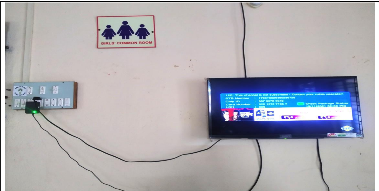
GIRLS' COMMON ROOM