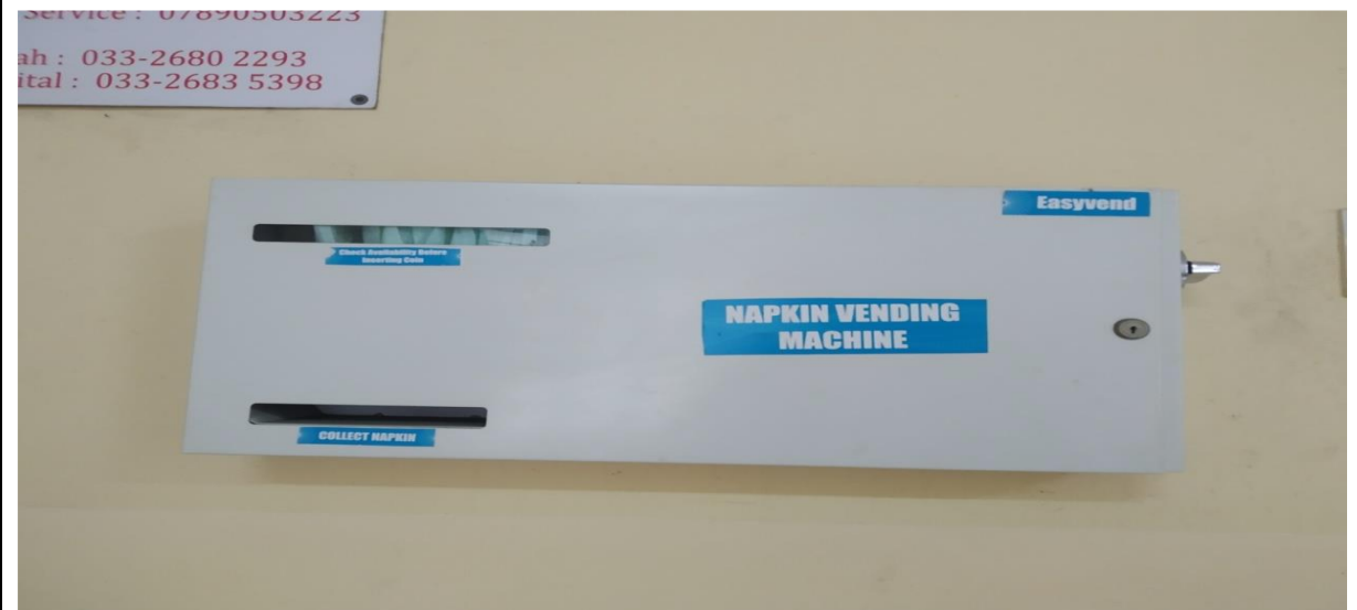
FREE SANITARY NAPKIN VENDING MACHINE