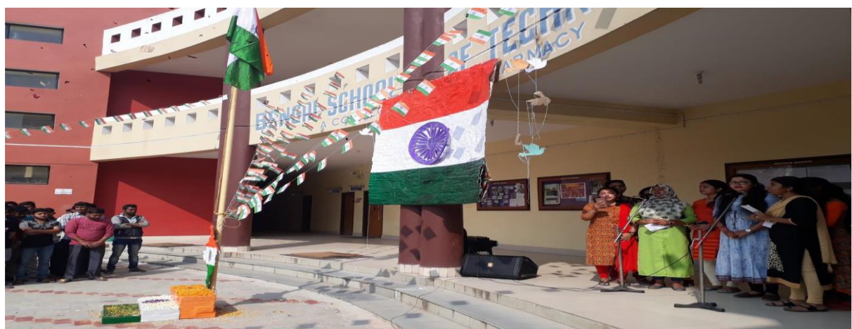
CELEBRATION OF REPUBLIC DAY