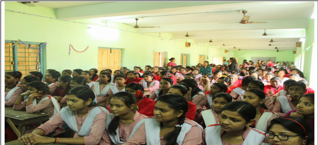
EDUCATING GIRLS ABOUT MENTRUAL CYCLE IN A HEALTH CAMP