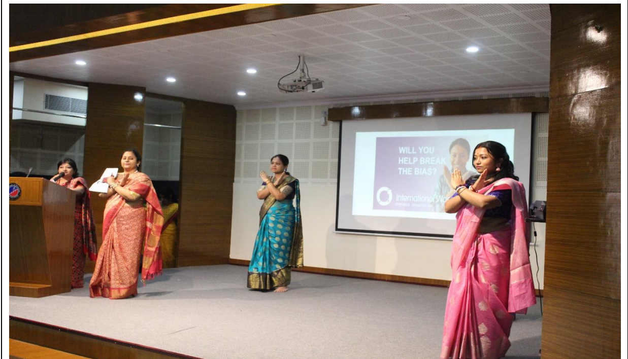
#BREAK THE BIAS #GENDER EQUITY