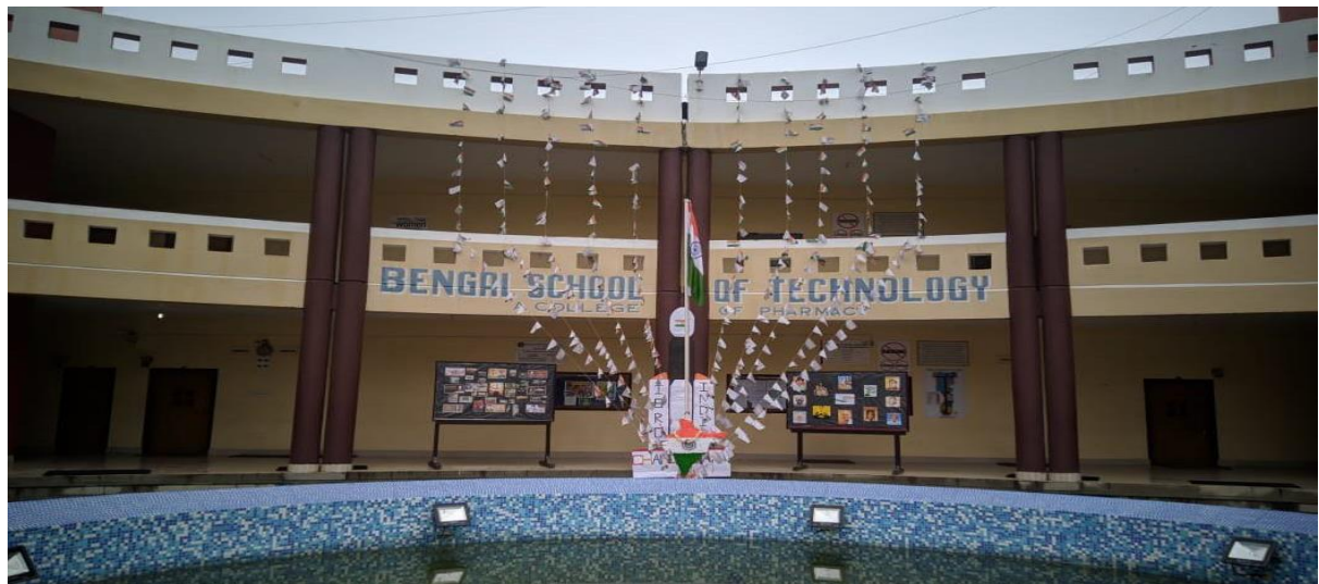
CELEBRATION OF INDEPENDENCE DAY