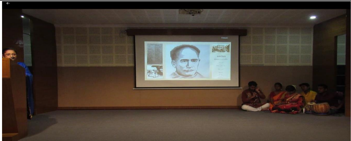
CELEBRATION OF ISHWAR CHANDRA VIDYASAGAR'S BIRTHDAY